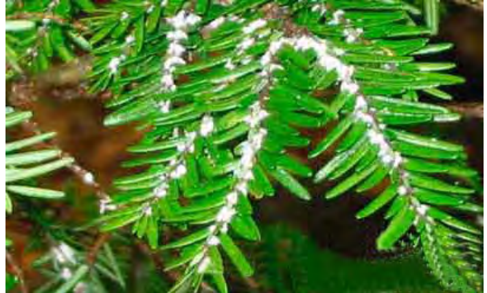
Hemlock Woolly Adelgids, covered in their wool, attached at the base of the hemlock needles.

If your trees are so tall that you cannot apply soap or oil to the entire tree, select another treatment option or contact an ar-